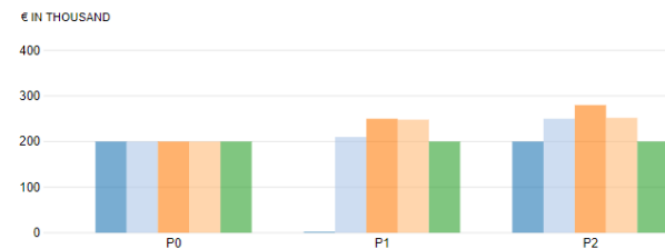
Example: Diagram of advertising